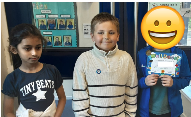
Otters: Aysha, Draven.