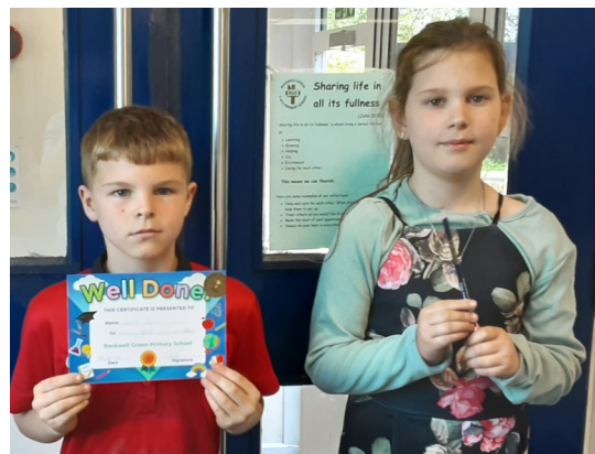
Squirrels: Stevie, Phoebe,