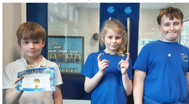
Squirrels: Ozzy, Anja, Harley