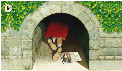
The Tunnel Anthony Browne