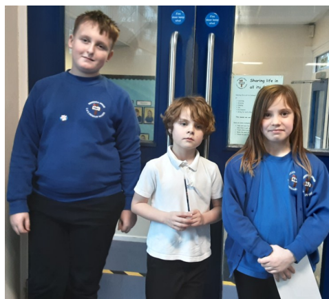
Squirrels: Harley, Jonty & Harper