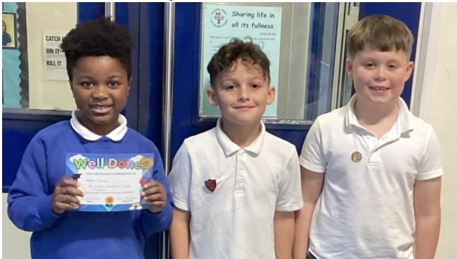
Otters: Divine, Elijah, Rowan