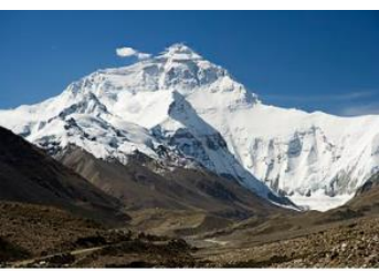
World's highest Everest 8848m