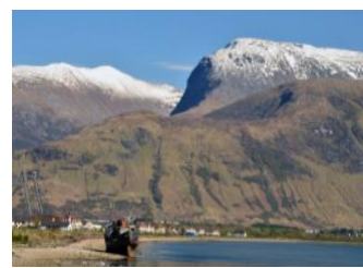
UK's highest Ben Nevis 1345m