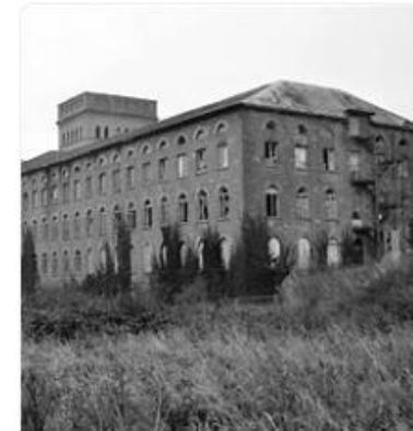
Fox Brothers Cotton Mill, Wellington, Somerset,...