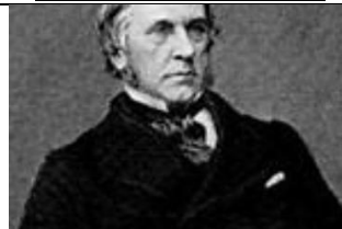
Edmund Cartwright (1743-1823)

Present information about this 'significant historian' in any way you choose!