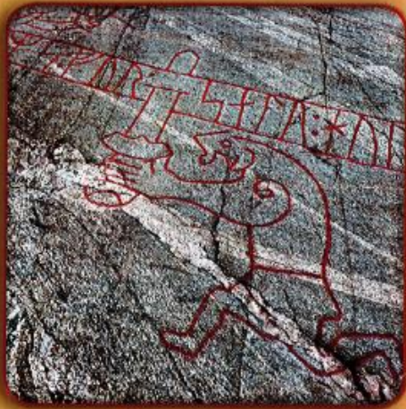
This carving showing a Norse story is almost 1,000 years old.