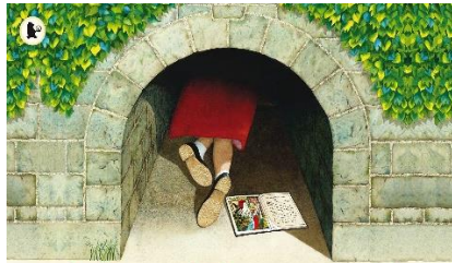
The Tunnel Anthony Browne