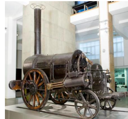
'Rocket' built in 1829. An early locomotive designed by Robert Stephenson