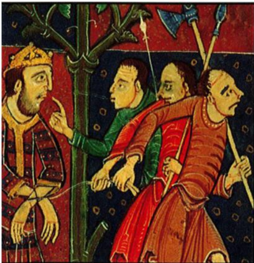
"Heard any good sagas recently?" King Ella fails to break the ice with the sons of Hairy-Breeks.