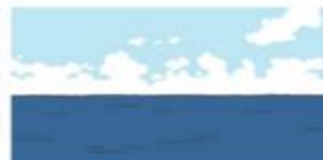
sea or ocean