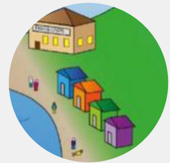
Tourism and Leisure