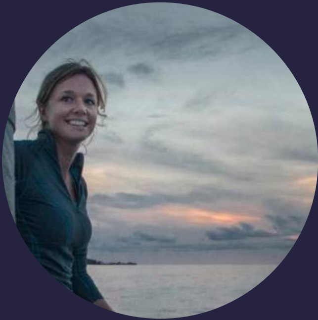
Sunset on ship

As I sail all over the world, I get to see how special the ocean is and how much it's worth to people.